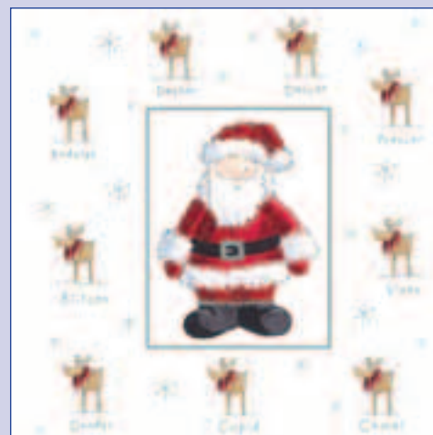
2. Santa and His Reindeer Pack of 10 cards. 137x137mm A fun card showing Santa and the names of his reindeer with silver foil detail.

The greeting inside the cards reads 'Wishing you a Merry Christmas and a Happy New Year'