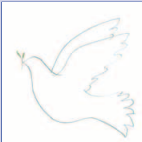
3. Dove of Peace Pack of 10 cards. 137x137mm A simple but striking card with an important message. Silver foil on a white background.