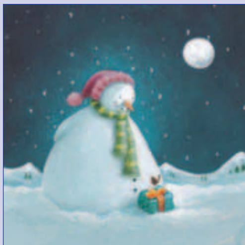
1. Snowman and Present Pack of 10 cards. 121x121mm This enchanting card features a snowman and robin on a snowy Christmas night.