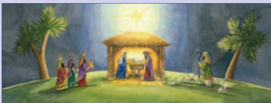
4. Manger Scene Pack of 10 cards. 86x228mm A colourful card depicting the true meaning of Christmas.

The greeting inside the cards reads 'Wishing you a Merry Christmas and a Happy New Year'